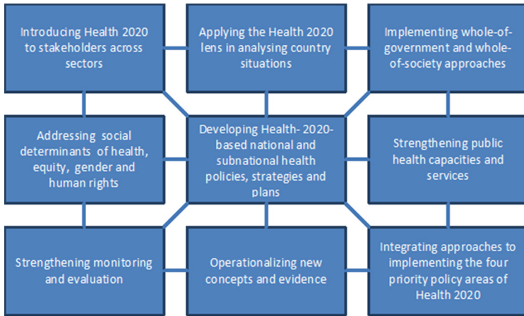
Figure 2. The nine package components of Health 2020

terms of public health, analysing the European Action Plan for Strengthening Public Health Capacities and Services and its associated self-assessment tool will also give clear guidance. Health 2020 is not for academic study and dusty shelves; it is a guide for practical implementation.