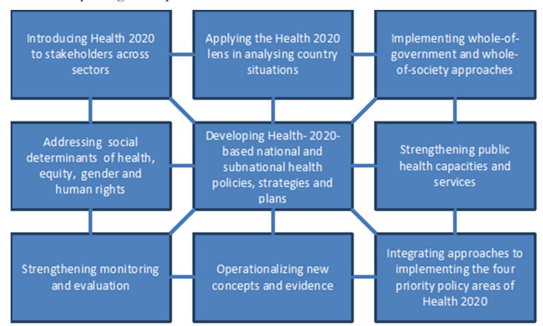
Figure 2. The nine package components of Health 2020

terms of public health, analysing the European Action Plan for Strengthening Public Health Capacities and Services and its associated self-assessment tool will also give clear guidance. Health 2020 is not for academic study and dusty shelves; it is a guide for practical implementation.